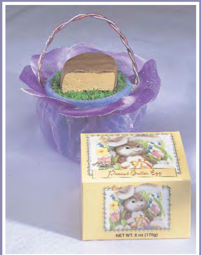
X18. Peanut Butter Egg. Milk chocolate egg with creamy smooth peanut butter center. KD 6 oz. box. $9.00