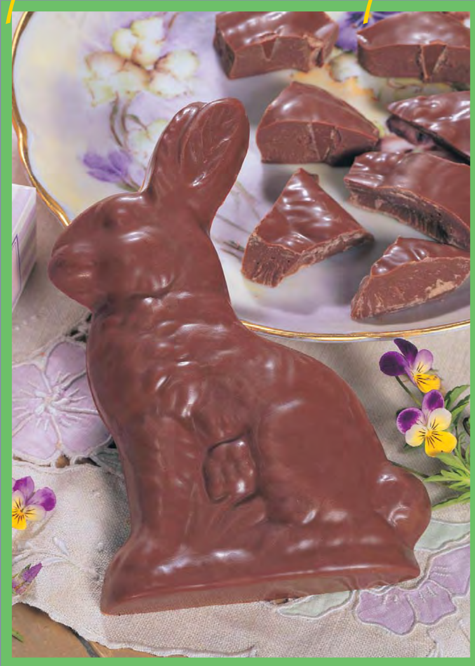
X15. Milk Chocolate Bunny. This charming solid milk chocolate bunny is packed in a pretty, pastel gift box, 4.5 oz. $6.50