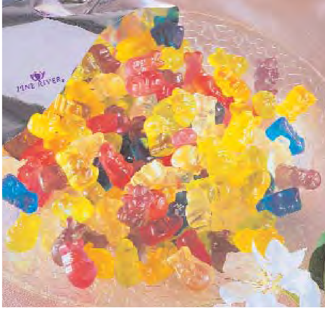
X16. Gummy Bunnies. Made with fruit juice. Lemon, berry, grape, lime and pineapple flavors, 7 oz. foil bag. $6.50